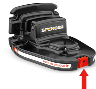
Quick release button

Downtime is the enemy of productivity. That is why AMBUJET is engineered to be easy and fast to install, while minimizing the need for routine maintenance. Thanks to the perfect integration between the fastener and the suction unit, the overall dimensions remain almost identical to those of the suction unit itself.