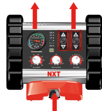
Quick release button

Innovation starts with understanding what our customers need and, as a global leader in EMS technologies, Spencer is anticipating all the challenges of a changing industry. Thanks to our latest innovation, we create a new layout for fasteners which are fully interchangeable between Ambujet S and all NXT ventilators made by Spencer.